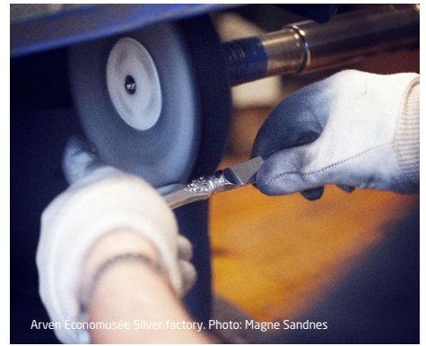
Arven Economusée Silver factory.