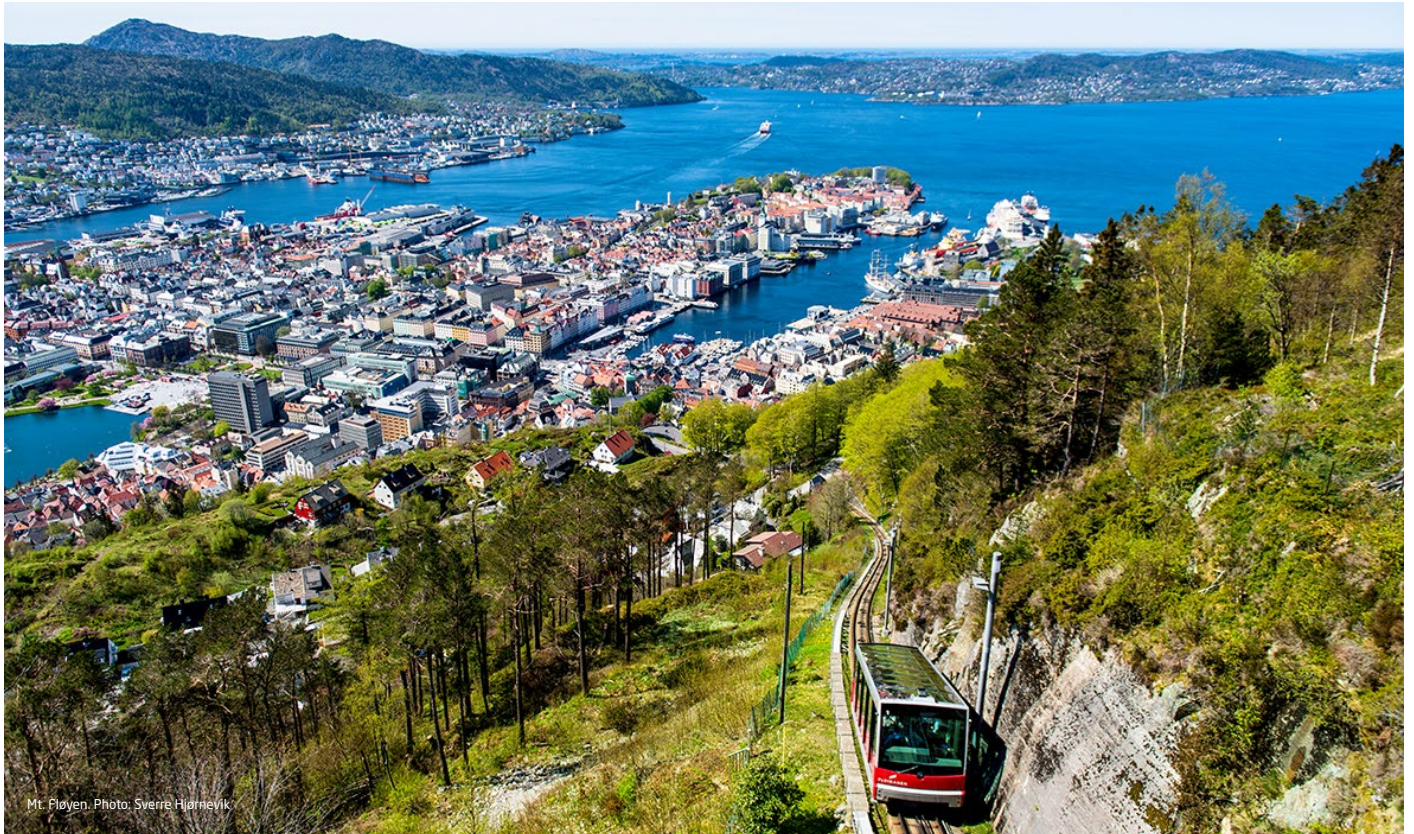
Mt. Fløyen.

Events: Bergen International Festival (May-June), Night Jazz - Jazz Festival (May-June) Bergen Philharmonic Orchestra (all year) Edvard Grieg Museum Troidhaugen (May-September) lunch concerts every day. Cruise Season: All year Average temperature: www.met.no Useful links: www.bergenhavn.no , www.visitBergen.com/cruise