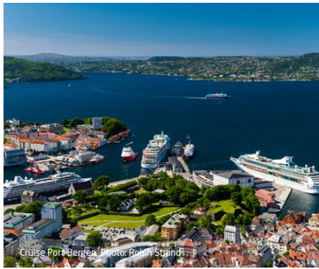
Cruise Port Bergen.